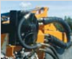
Oil cooler with thermostat