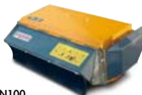
TN100 Direct Drive