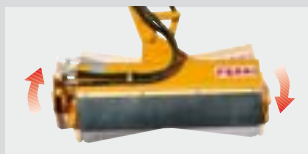
Floating head system