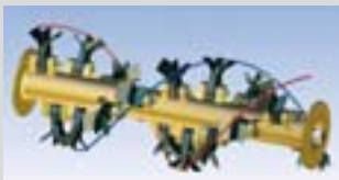
"OVERLAP" spiral rotor with two spiral rows