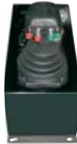
Monolever electric control